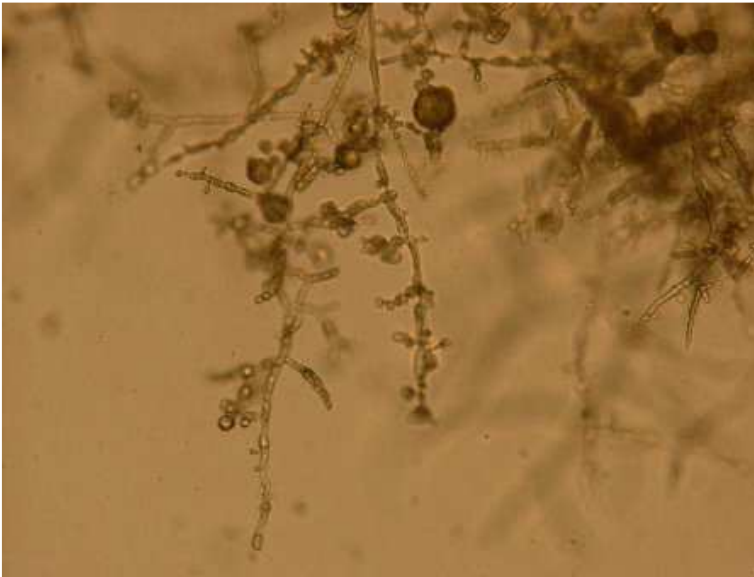
Fig 2. Branched dendroid-like hyphae of Phytophthora ramorum on the bottom of an agar plate, photo by Arja Lilja.