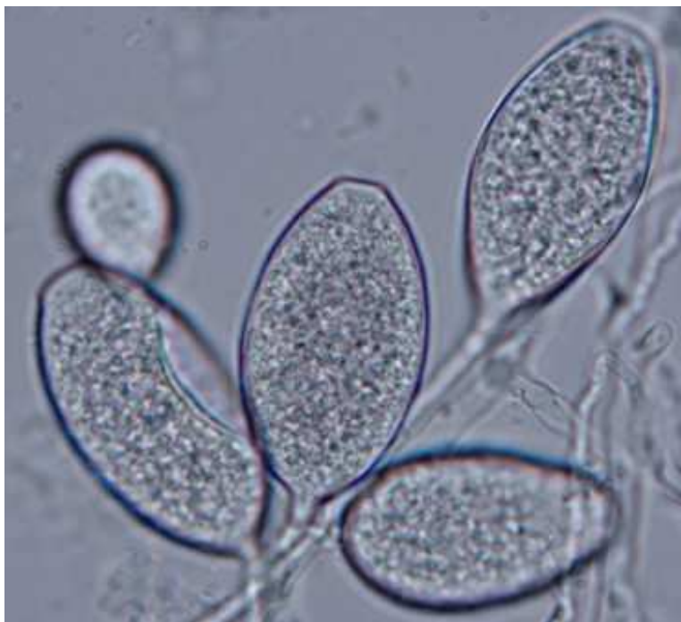
Fig 1. Sporangia of Phytophthora ramorum in soil extract water, photo by Arja Lilja.

Common names: Twig and leaf blight (EU), Ramorum leaf blight (North America), Sudden Oak Death= SOD (North America), tamme-äkksurm (EE), maladie de l'encre des chênes rouges (FR), mort subite du chêne (FR), tammen äkkikuolema (FI), europæisk visneskimmel (DK, European isolates) / californisk visneskimmel (DK, North American isolates), Plötslig ekdöd (SE), Plötzliches eichensterben (DE), Nagła śmierć dębu (POL).