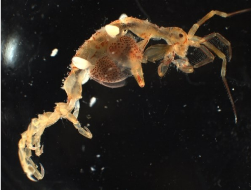
Caprella mutica , female with brood pouch, but no visible embryos. Photo by Siomon Blauenfeldt Leonhard, Orbicon and Vattenfall A/S (copyright).