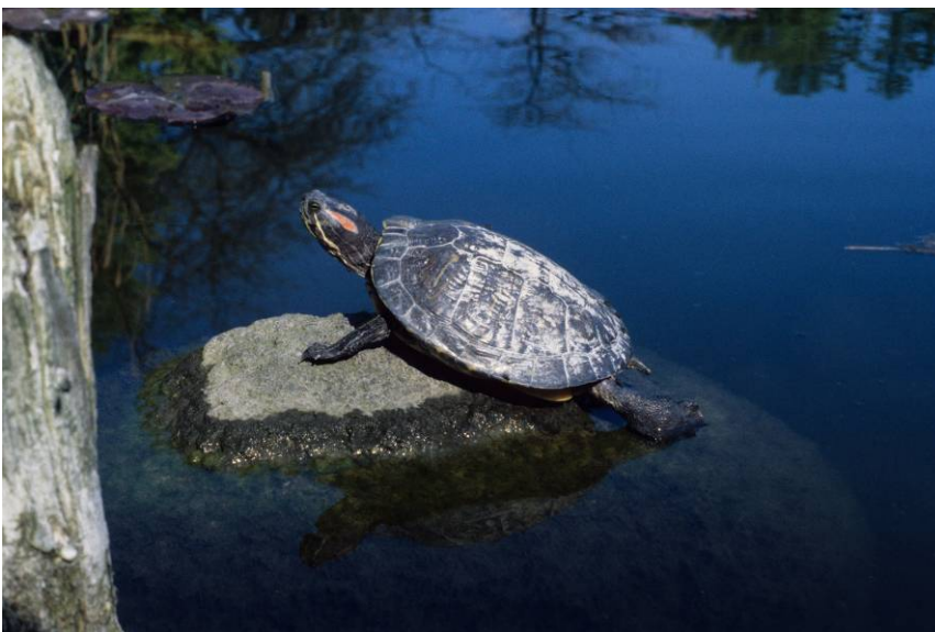
Fig 1. Adult female Trachemys scripta elegans basking on a rock in the Botanical Garden of Copenhagen, Denmark. The conspicuous reddish orange to red stripe behind the eye is characteristic of that subspecies.

Trachemys scripta troostii (Holbrook, 1836): Cumberland slider (US), Troost's terrapin (GB), cumberland-terrappin (DK), Gelbwangen-Schmuckschildkröte or Troosts Schmuckschildkröte (DE).