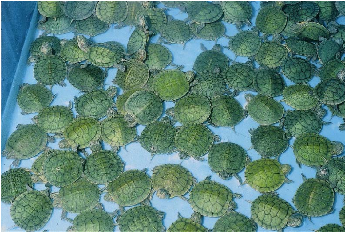
Fig 2. A group of juvenile Trachemys scripta elegans photographed in a pet shop. In all three subspecies the carapace is bright green, photo by Henrik Bringsøe.