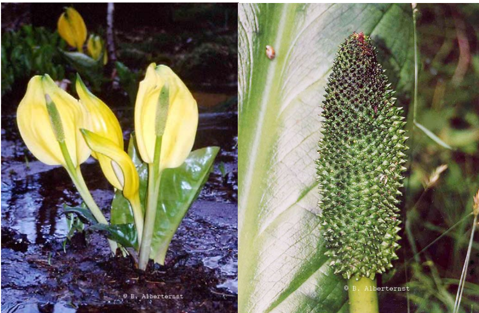
Fig. 1 and 2. Lysichiton americanus inflorescences and spadix, photo by Beate Alberternst.

Common names: American Skunk-cabbage (GB), Western Skunk-cabbage (US), Amerikanischer Stinktierkohl (DE), Amerikanische Scheinkalla (DE), Amerikanischer Riesenaronstab (DE), ameerika kevadvõhk (EE), keltamajavankaali (FI; kelta = yellow, Lysichiton = majavankaali), skunk-kala (NO), Tulejnik amerykański (PL), amerikansk skunkkalla (SE), gul skunkkalla (SE).