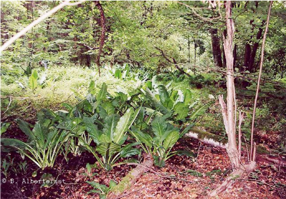
Fig. 3. Lysichiton americanus population, photo by Beate Alberternst. You may see more photos of the species on the virtual flora of Sweden.