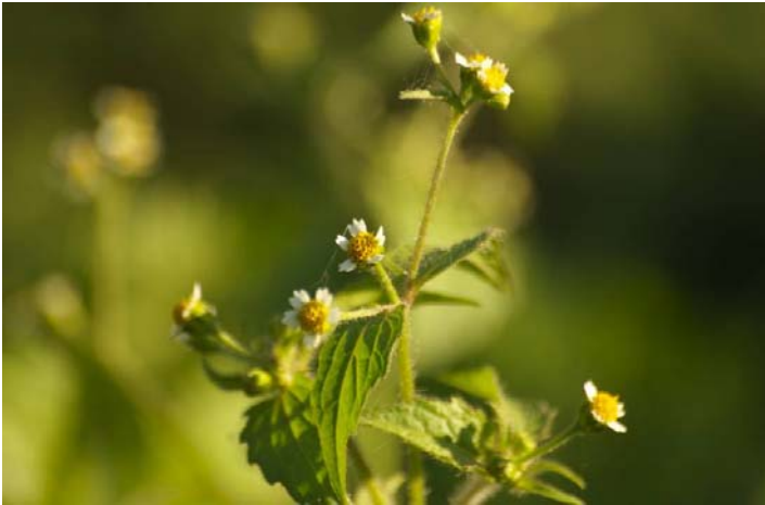
Fig. 2. Flowers of Galinsoga quadriradiata .