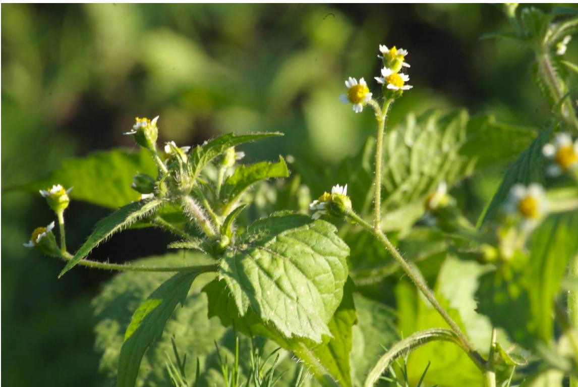
Fig. 3. Leaves and flowers of Galinsoga quadriradiata .