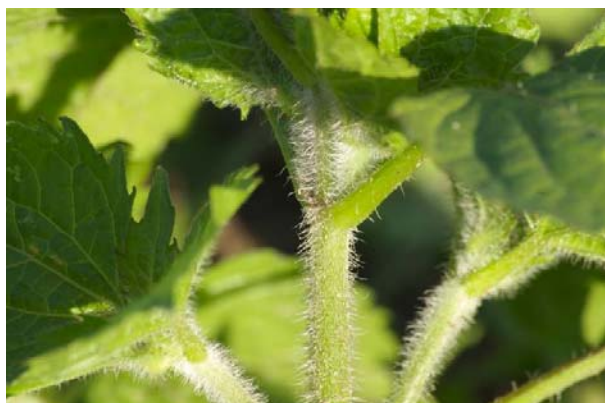
Fig. 1. Stem of Galinsoga quadriradiata , photo by Normunds Rustanovičs.

Common names: hairy galinsoga/shaggy soldier (GB), behaartes Franzosenkraut (DE), kirtelkörtstråle (DK), karvane võõrkakar (EE), ripsisaurikki (FI), blakstienotoji galinsoga (LT), matainā sīkgalvīte (LV), harig knopkruid (NL), nesleskjellfrø (NO), żółtlica owłosiona (PL), галинзога четырёхязычковая (RU), hårgängel (SE), pět'our srstnatý (CZ).