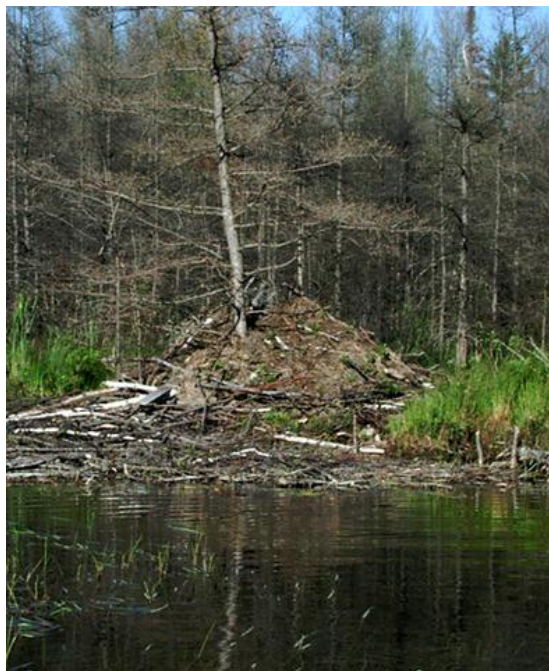
Fig. 3. Beaver lodge built by Castor canadensis in its native environment, photo by Phil Myers, Animal Diversity Web, University of Michigan, Museum of Zoology.

There is a possibility of competitive exclusion of Castor fiber by C. canadensis (Nummi 2001) due to higher reproductive output, since litter size is bigger in C. canadensis (Danilov 1995). Actually, we can see competitive displacing of C. Canadensis by C. fiber in the South of the Russian side of Karelia (Данилов 2005). C. Canadensis seems to be a little more active constructor of dams and lodges than. Otherwise the ecological engineering by both species have a similar keystone effect on various plant and animal species, including fish, amphibians and birds (Wright et al. 2002, Rosell et al. 2005, Nummi 2006).