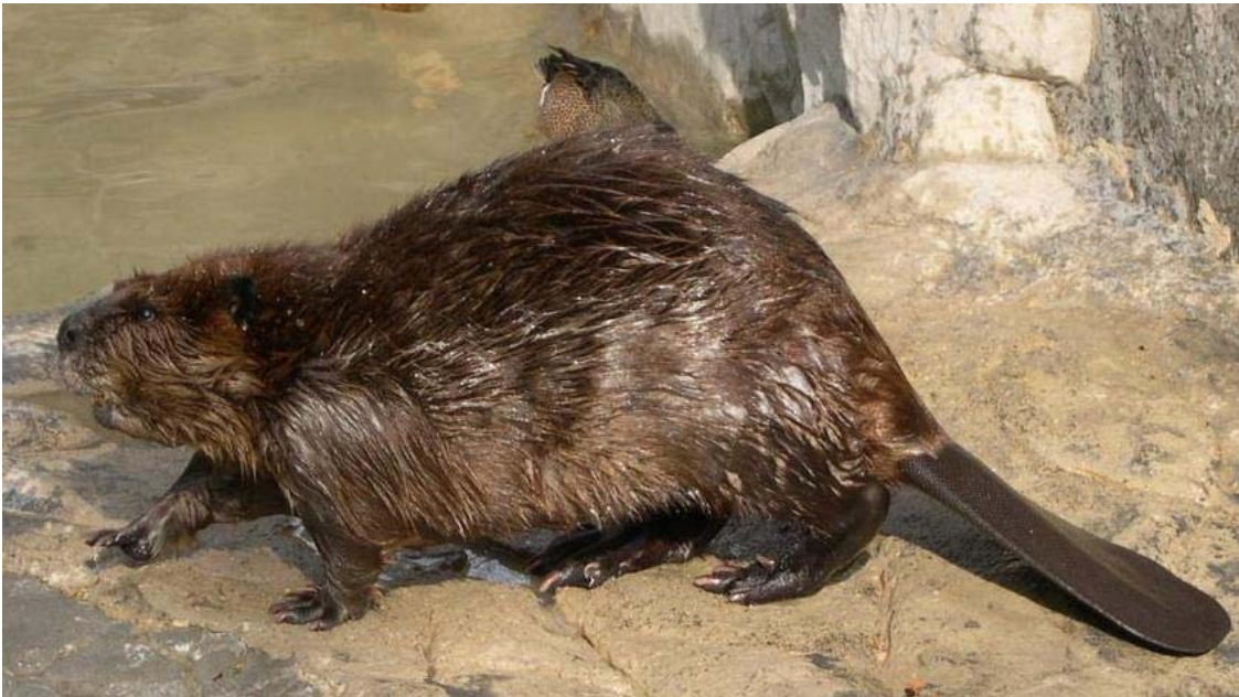
Fig. 1. Castor canadensis from National Zoological Park, Washington, D.C.

Common names: Beaver (GB) Kanadischer Biber, Amerikanischer Biber (DE), bæver (DK), kobras (EE) kanadanmajava (FI), Канадский бобр (RU), nordamerikansk bäver (SE).