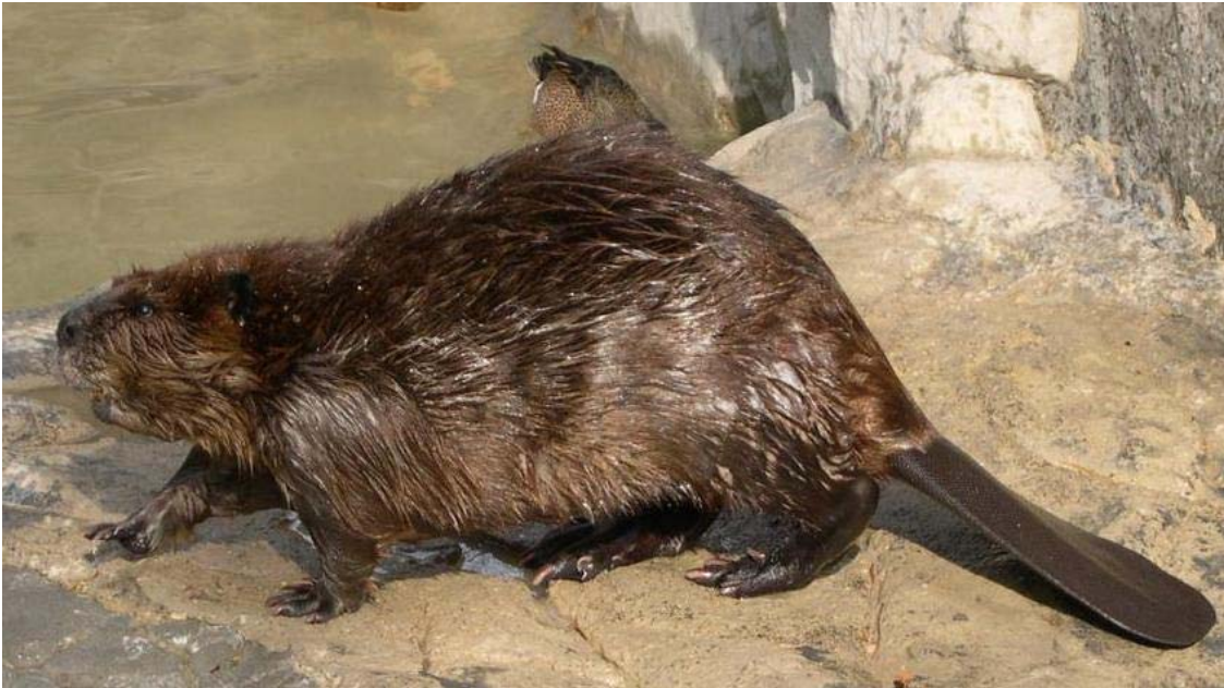
Fig. 1. Castor canadensis from National Zoological Park, Washington, D.C.

Common names: Beaver (GB) Kanadischer Biber, Amerikanischer Biber (DE), bæver (DK), Kanada kobras (EE) kanadanmajava (FI), bjór (IS), Канадский бобр (RU), nordamerikansk bäver (SE).