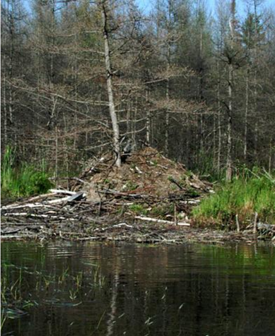
Fig. 3. Beaver lodge built by Castor canadensis in its native environment, photo by Phil Myers, Animal Diversity Web, University of Michigan, Museum of Zoology.